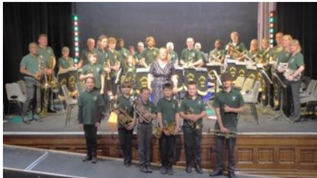
The Haverhill Youth & Community Band