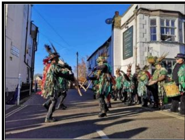
The Green Dragon Morris Dancers